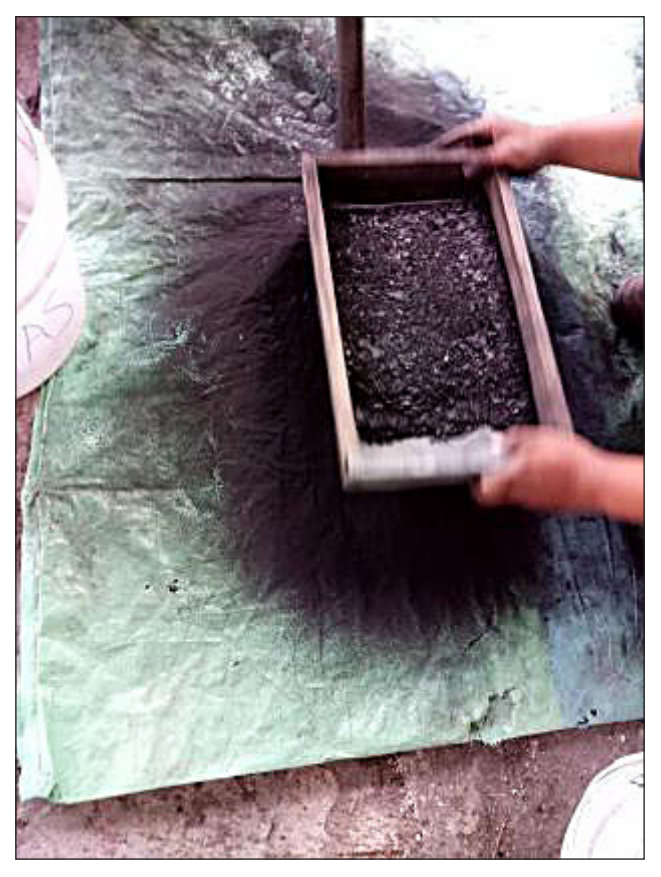
Figure 3. Charcoal sieving with 40 mesh size