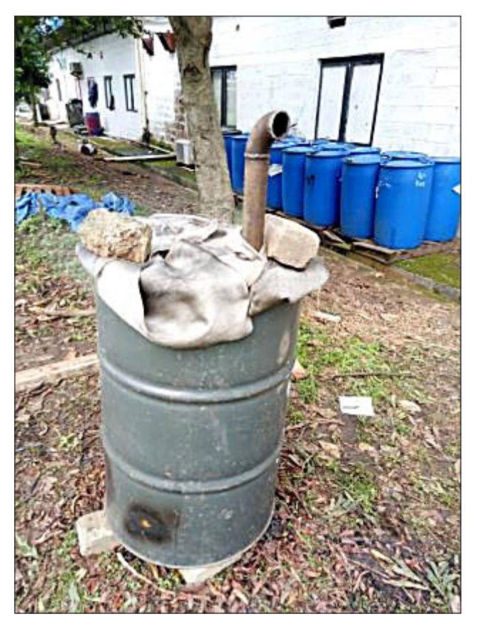
Figure 1. Organic waste carbonization process