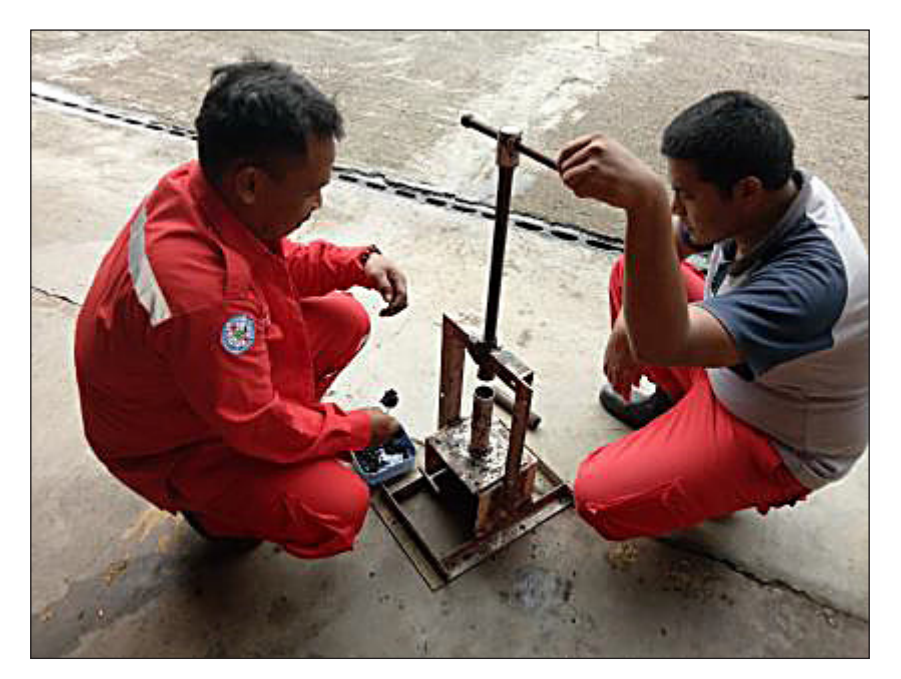
Figure 2. Pressing briquettes with pressing tool

carried outfor 8 hours, it was fund that the minimum temperature value was 143°C for burning leaves, and the maximum temperature was 220°C in the case of burning twigs, with the average temperature ranging from 162.22 °C to 199.67 °C