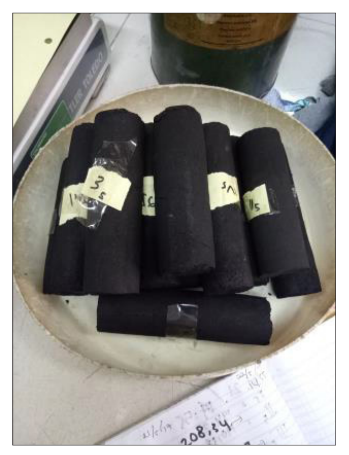
Figure 4. Bio-charcoal briquettes